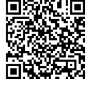
St Mary's Church